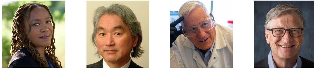
(From Left) Heather McGhee, Michio Kaku, Walter Isaacson, Bill Gates