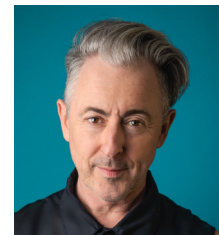
(From Left) Abby McEnany, Sutton Foster, Kal Penn, Alan Cumming