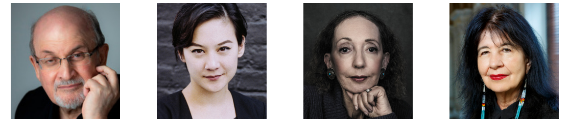
(From Left) Salman Rushdie, Michelle Zauner, Joyce Carol Oates, Joy Harjo